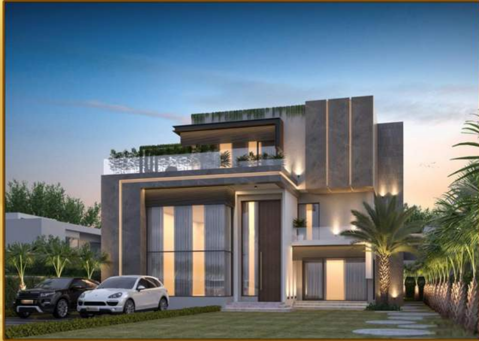
Emaar Emerald Hills 750 sq.yd Turnkey Project