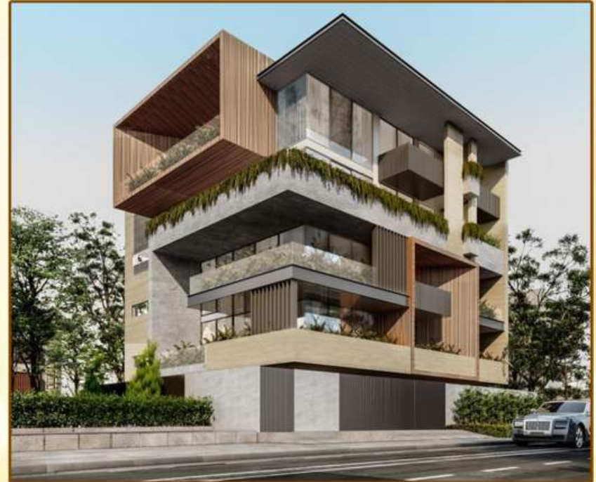
Adani, sector 60 650 sq.yd Self-owned Independent Floors