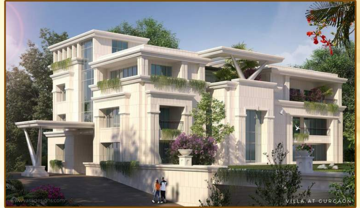
Shahtoot Marg, DLF phase 2, (1000*2) sq.yd Turnkey project