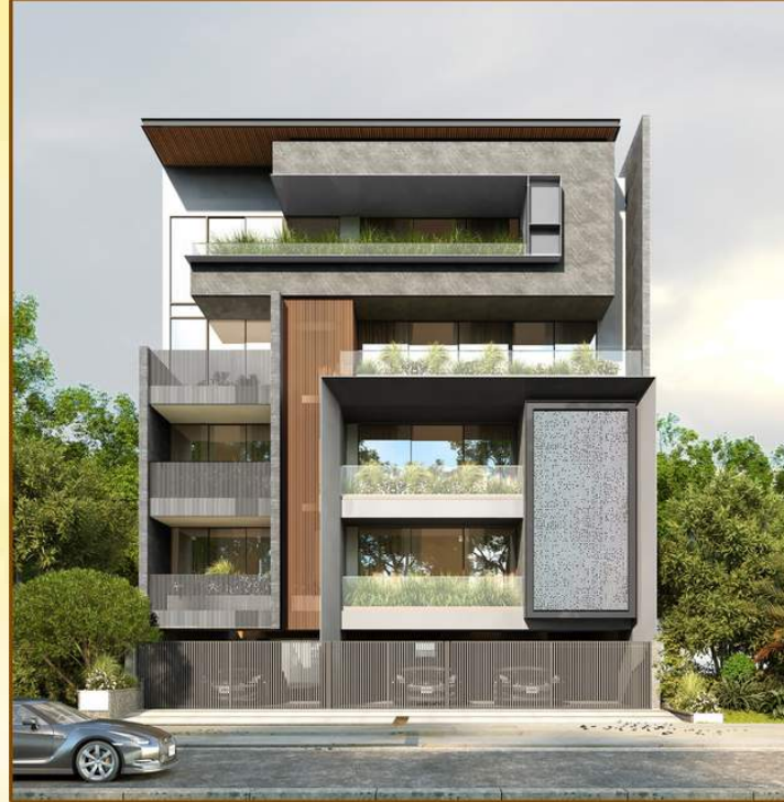
Emaar Emerald Hills 500 sq.yd Turnkey project