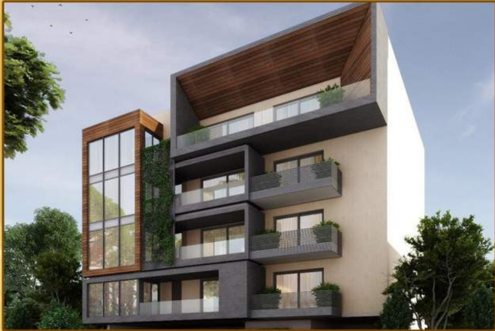
Aaron Ville 455 sq.yd Self-owned Independent Floors