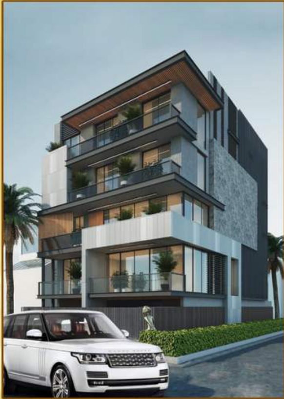
Ananthraj, sector 63A (344*2) sq.yd Self-owned Independent Floors