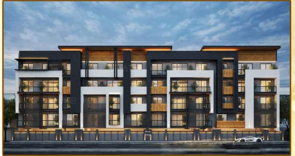
Olive Residency (478*4) sq.yd Self-owned Independent Floors