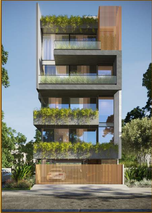
One Good Earth 180 sq.yd Turnkey Project