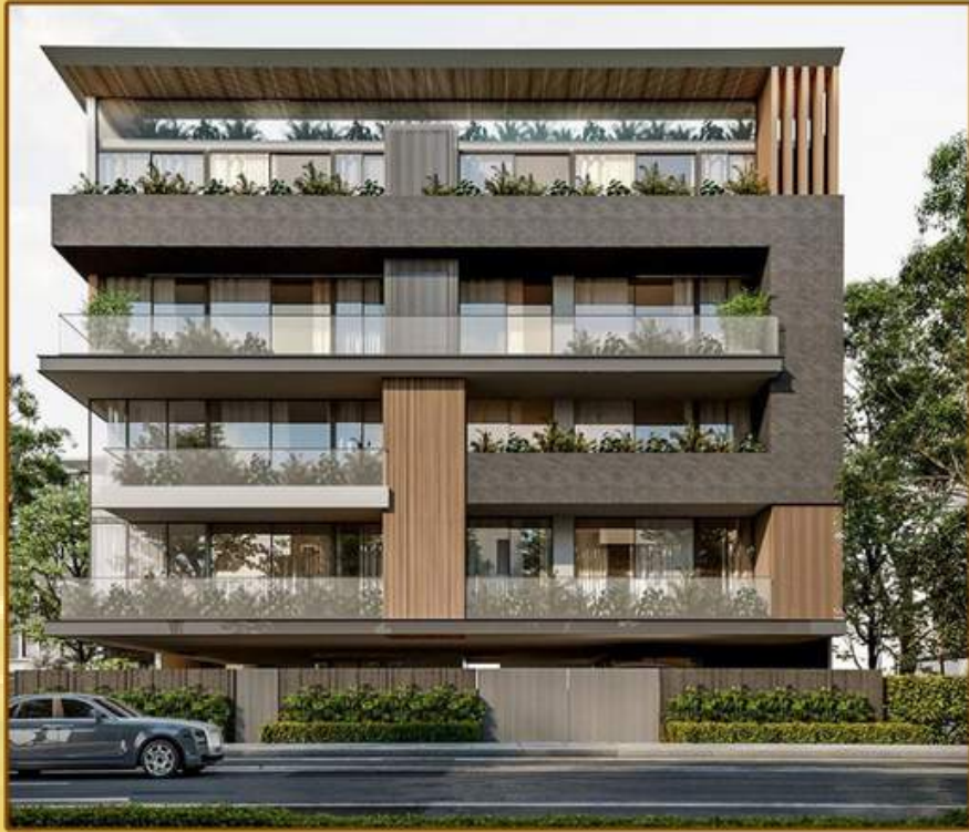
Mayfield Garden (288*2) sq.yd Self-owned Independent Floors