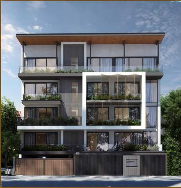
Mayfield Garden 500 sq.yd Self-owned Independent Floors