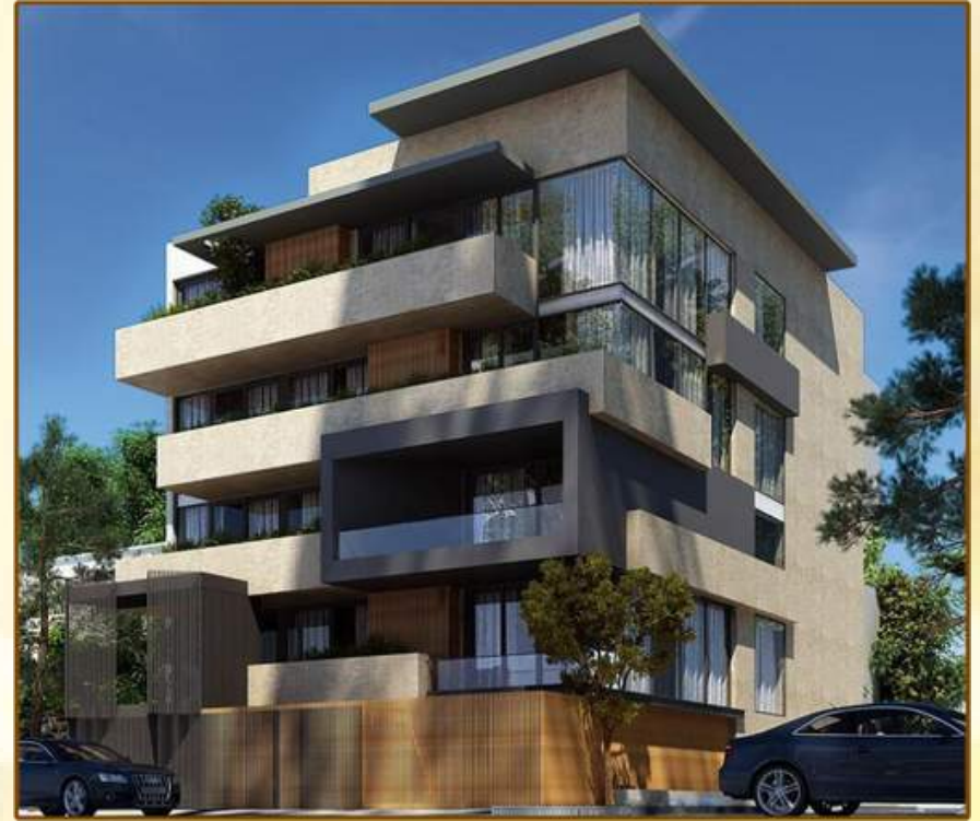
Adani Samsara 500 sq.yd Self-owned Independent Floors