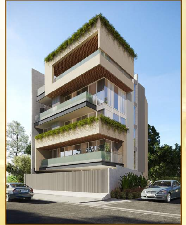
Adani Samsara 322 sq.yd Turnkey Project