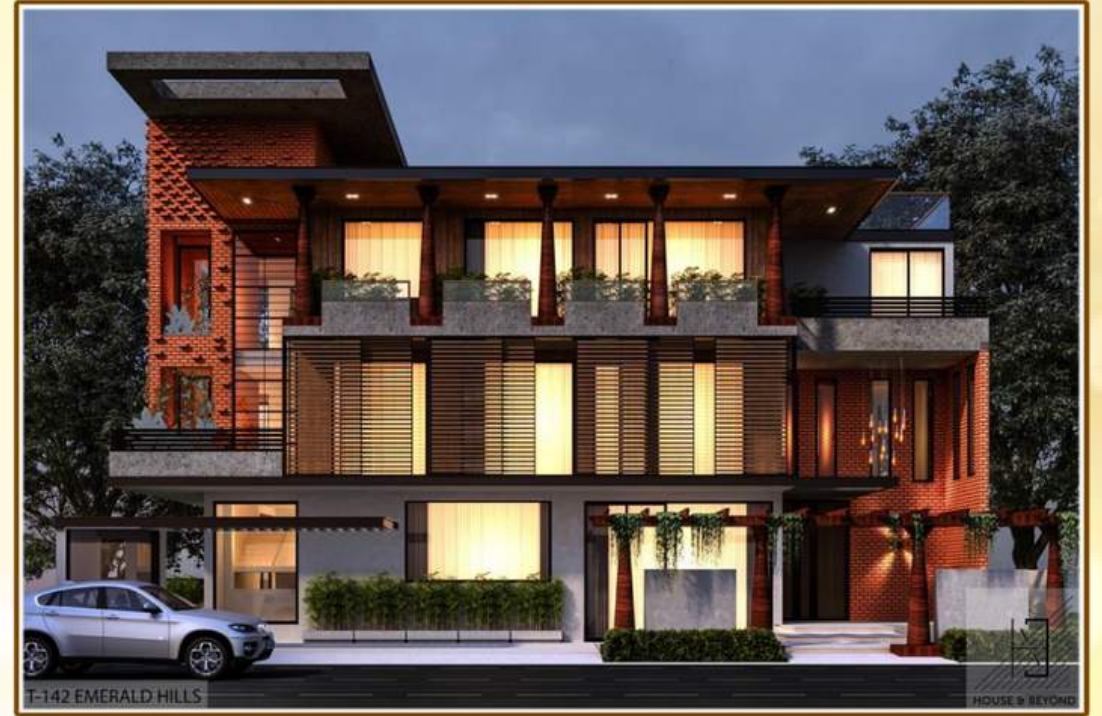
Emaar Emerald Hills 825 sq.yd Turnkey Project