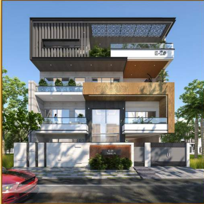
South City II 500 sq.yd Turnkey project